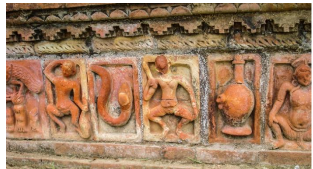
Figure 4: Paharpur Terracotta ornamentation, Bogra (wikimedia, 2007)

From the 16th century onwards, terracotta art originated throughout undivided Bengal mainly in the temple architecture.