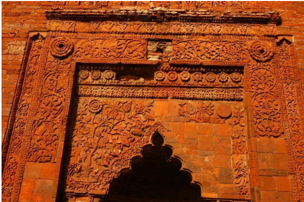
Figure 5: Darasbari mosque ornamentation, Chapainawabganj (IRB-travel-Team, 2022)

patterns in unbroken panels, depicting episodes from the great Hindu Epics (Ahmed, 1990) these were the first attempt at architectural ornamentation that broke the monotony of exterior façade walls. The terracotta temples of Bangladesh were built in accordance with the architectural traditions in response to communal needs of local people (Mahmud, 1993).