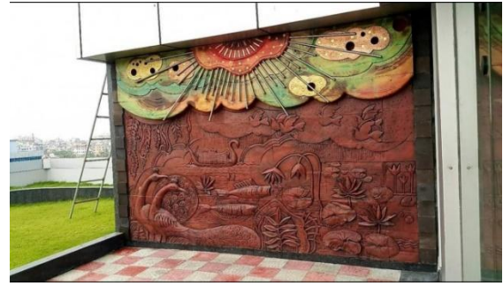
Figure 14: Modern Wall Terracotta (The Business Standard, 2022)

Terracotta is among the oldest of manufactured building products, yet it has once again become a sustainable material of preference in contemporary façade design. Full of earthy energy, this prehistoric material generates a certain warmth and aristocracy feeling and enhances even the coldest color themes, and perhaps that is why terracotta murals or terracotta themes remain classic pieces in architectural space creation. It is one of the most popular choices for decorating a landmark, a plaza or any outdoor breathing zone in Bangladesh. Terracotta plaque either replicable product or onsite casting format appears to be make a return in popularity with new design and technique wooing the people back.