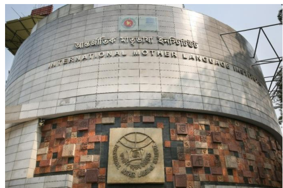
Figure16: Terracotta Mural on the front façade of International Mother Language institute, Dhaka (Shovon, 2021)