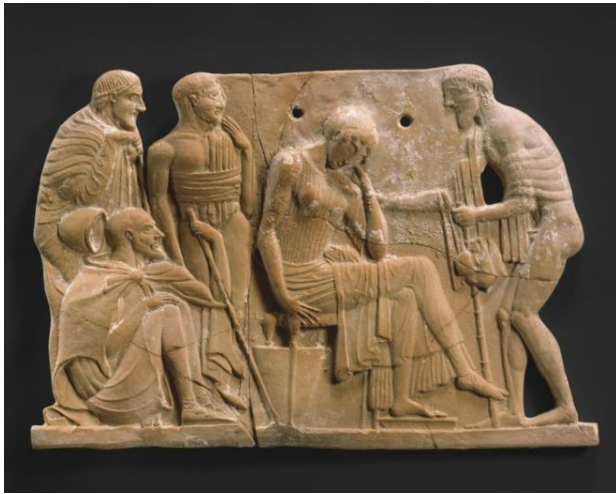
Figure 1: 'Odysseus returning to Penelope'-A classical terracotta plaque (ca. 460–450 B.C.) (Metropolitan Museum, 2022)

break the monotony of the plainness of the temple walls. These plaques also served as a source of instructions and entertainment for the pilgrims. Terracotta plaques are generally covering a large area of a temple complex. Such extraordinary work requires the services not of one modeler, but of the entire modeler's guild.