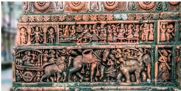
Figure 6: Kantajew Temple ornamentation, Dinajpur (Nijhoom Tours, 2022)

Early terracotta plaques exemplify the use of clay as a sophisticated expression of urban culture. (Schendel, 2009) The best known are magnificent plaques from an area in the south-western delta that archaeologist refers to as Chandraketurgh now just across Bangladesh's western border with India. Initially the Muslim Sultans didn't accept the terracotta art of the country as they were opposed to any kind of figural representation (Mahmud, 1993).