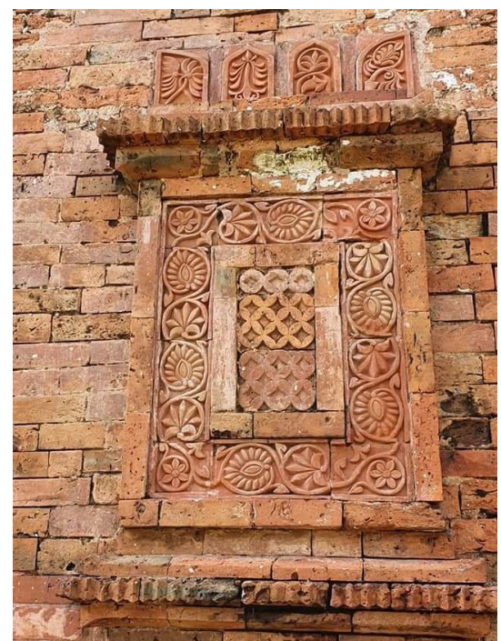
Figure 8: Khalifatabad monuments: Chunakhola Mosque terracotta