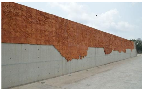
Figure17: 'Struggle for Independence', Terracotta Mural, Museum of Independence- Wall, Suhrawardy Udyan, Dhaka, (Wikimedia, 2015)

Terracotta endure to remain an important part of our modern architectural place making and space articulation and an intellectual blending can be find at some projects. That use of terracotta in characterizing public spaces in our modern architectural practice is a brilliant reflection of ingenuity and creativity. An exceptional wall in the open square in Suhrawardy Udyan is decorated with terracotta. The entire history from the language movement to the freedom war and the moment of victory is recorded in the same canvas. This terracotta wall along with the calm green garden is silently teaching the history to the residents of the busy city. Also a mural built in road island adjacent to the British Council of Dhaka University for memory of martyrs, has been able to capture the roots-searching character of the entire educational institution.