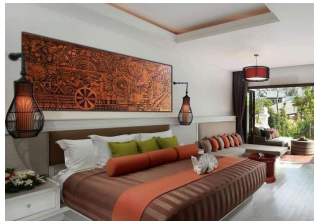
Figure 11: Modern Wall Terracotta of Bangladesh, (Example 2) (Naher, 2021)

In an indoor room or gallery, use of terracotta break the monotony of surface. Sometimes it represents the aristocracy of the residents as well as the choice and cultural awareness. To keep vernacular image in the home decor, a terracotta mural can be a perfect addition. Terracotta murals create an artistic atmosphere in the lobby or garden. Besides, commercial public places as like restaurants, small offices owners nowadays want a specific theme for their premise. Therefore, the terracotta theme can be a great way to bring the native atmosphere inside the enclosure. In this case, terracotta pots or small wall pieces for wall decor, Terracotta blocks, bells, pots etc. are being used to decorate the vertical enclosures and even ceiling.