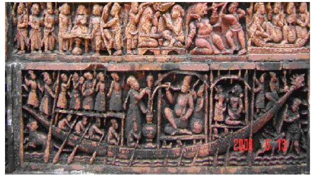
Figure 3: Mainamati Terracotta ornamentation, Comilla (world-heritage, 2012)

represent various scenes and figures in an uncomplicated and vigorous form (Majumder, 1963).