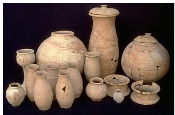
Figure 2: Pottery excavated from the ruins of the Indus Valley Civilisation

for more than 100 years, Terracotta has been an integral but largely unknown part of America's architectural legacy. Later it begins in the nineteenth century and reach in peak in the Art Deco period. During renaissance period, terra cotta has been used to adornment of facades, rooflines, openings and create many of the most famous and fanciful architectural reliefs (Tunick, 1997).