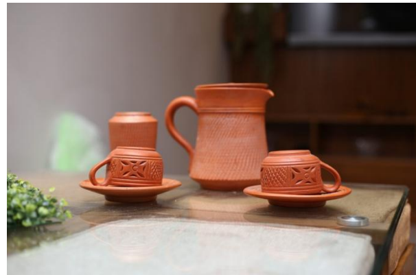
Figure 9: Terracotta handicraft (B Property, 2022)

cosmopolitan city, a terracotta pottery, showpiece or mural in indoors tables, walls, workplaces remind us of our roots.