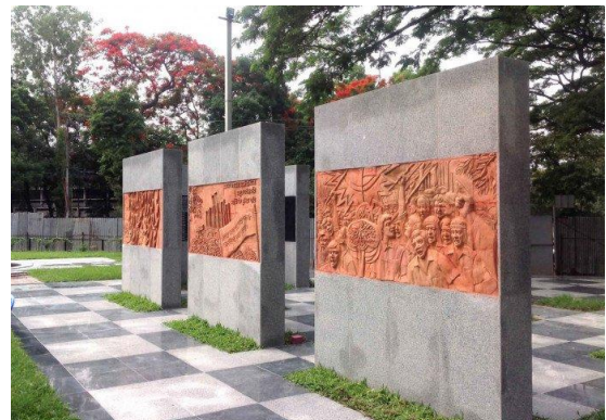
Figure 15: The mural of 'Memory Eternal' premise at the University of Dhaka, depicting the liberation war martyrs of the university (Naher, 2021)

A bright interpretation of brick architecture, the distinctly modern uses terra-cotta tiles arranged in geometric lines to blend with the surrounding buildings. A new trend of residential building design by the Architects in Banani neighborhood at Dhaka. The terra-cotta shows homage to the older brick buildings that surround it. It has applied for roof tiles, statues, capitals, medallions, plaques, murals, landscape elements and other small architectural decorations.