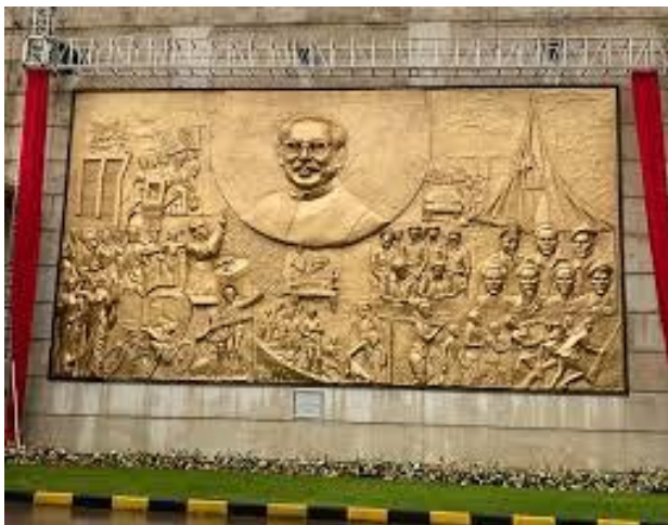
Figure 13: The mural of 'Memory Eternal' premise at the University of Dhaka, depicting the liberation war martyrs of the university (Mrinal Haque, 2022)